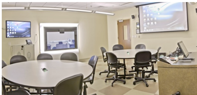
Fig. 1: The classroom

This program's courses are all offered in the evening and are three hours in duration. The faculty members share a classroom that is outfitted with the Cisco Telepresence technology. The classroom also has an instructor station with a computer and dvd player that can be projected on to a screen. All students in the classroom have access to a laptop computer. Figure 1 is a picture of the classroom.