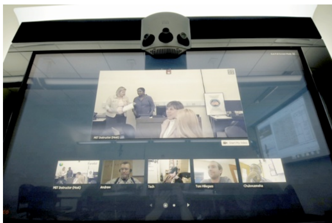
Fig. 2: Cisco Telepresence classroom technology

The instructor, classroom students, and distance students all log into a Webex virtual classroom for the duration of the class. The instructor can share files and websites with students as well as instant messages. Students can also private chat with one another in this program. Figure 2 shows some of the classroom technology in use.